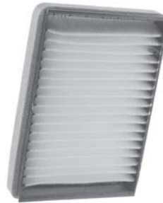
FILTER CABIN AIR