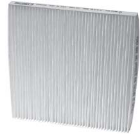
FILTER CABIN AIR